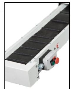
Optional Integrated Conveyor